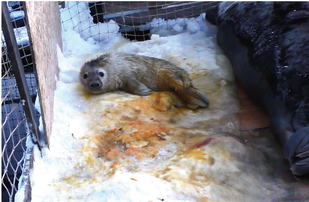
Figure 2. Newborn Atlantic gray seal ( Halichoerus grypus atlantica ) pup, Tim, inside the enclosure

On Day 2, 10 December 2019, after we managed to attract the female into the water using fish, the cage was again cleaned, and the level of the platform was raised. This was done to have a larger dry haul-out area for the mother–pup pair. Also, the pup’s weight was collected (9 kg). Given the daily weight gain documented for this pup at the end of the nursing period (Table 1), we can assume this pup weighed ~7 kg at birth. We discovered that the pup was rather small compared to those pups presented in the literature: gray seal pups have a normal weight range of 10 to 20 kg in the wild (Hall, 2002; Hauksson, 2007). At the Harderwijk Marine Mammal Park, newborn pups weighed around 15 to 17 kg in different years (Kastelein & Wiepkema, 1988, 1990; Kastelein et al., 1991). This pup’s small weight can be explained by the small size of its mother: